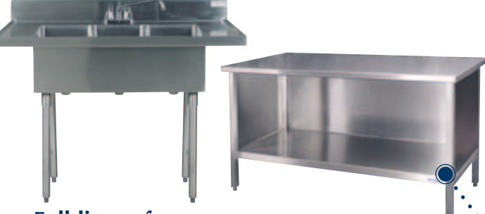
Full lines of NSF-listed stainless steel sinks, worktables, and wall shelving

No size, configuration or finish is too tough for Amtekco. Many standard items are available, or we can design a custom solution to meet your store's specific needs. Our value engineered products are extremely cost-efficient and our turnaround is very timely. Many Quick Ship items also are available for immediate delivery. Whether you need a single item or an entire store of equipment, Amtekco will be your partner to help you map out a solution.