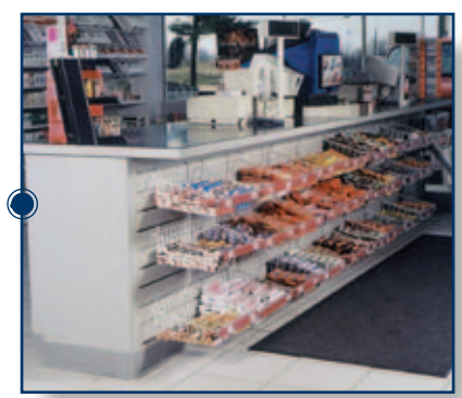
Customized cash register counters and front slatwall displays