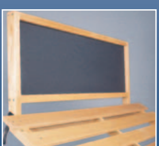
Oak frame chalkboard Size: 36" x 12" Code: W1 Size: 48" x 12" Code: W2