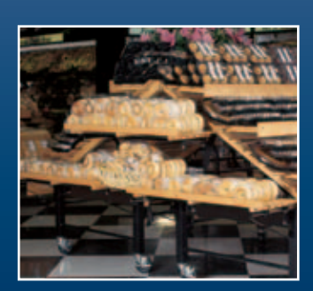
2-tier side display Code: DD