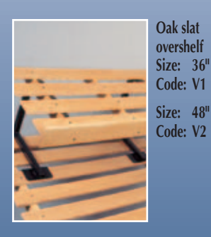
Code: V1 Size: 48" Code: V2