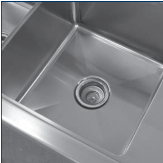
The Euro Sink's die formed drain system quickly and completely empties the sink bowl.